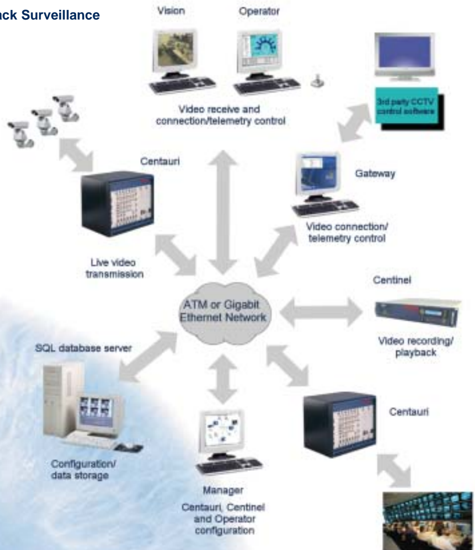
Fig 3. A CellStack Surveillance Solution